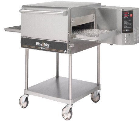
UM1854 (Single) with Optional Stand